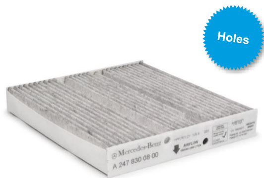
Image 2: The OE filters have two holes on both sides and a separate cover. Two pins placed in the housing can ingress in the filter as well as the pins on the cover.

The original cover (order no.: 247 830 85 00) is no longer needed.